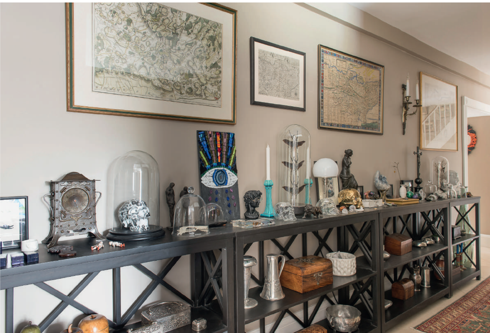
Above: The family call this display in a passage at the rear of the house 'Jane's Table of Curiosities'. It started as one shelf and grew into three tables as people gave her presents for it

sits on a console table made out of ebony by woodworker Gareth Neal, combining classic forms used in antique furniture, in a contemporary design. This is just one of many – and I mean, many - pieces in the house sourced from the Contemporary Applied Arts (CAA) gallery on the South Bank.