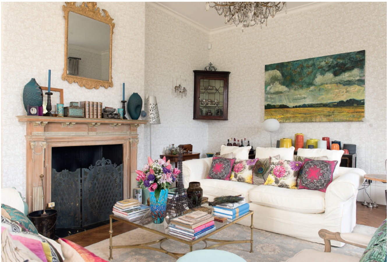
Above: Behind a sofa in the sitting room, a collection of ceramics by Tanya Gomez Right: More peacock feathers on a decorative screen. The late 19th century bronze figure is from Christopher Buck Antiques

building, with parts dating back to the 13th century, with a warren of service rooms including a butler's pantry, a flower room, laundry and a food pantry. Viewed from the main kitchen, framed by lit cupboards with Tiffany blue-painted interiors, it has the air of a proscenium arch, enclosing the scene set behind, with a central storage island, painted the same blue, stage centre.