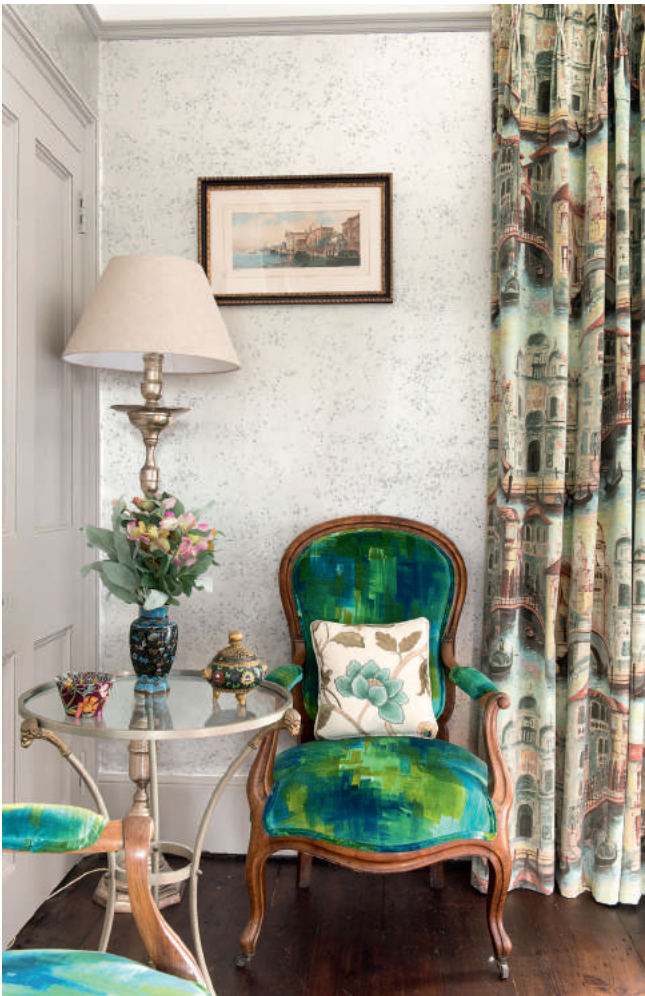
This page: The Venice bedroom features Venetian mirrors and curtains featuring Venetian scenes from Zoffany

reaction. “She said ‘a house like this should have moose heads, but that means killing things. We should get a unicorn.’”