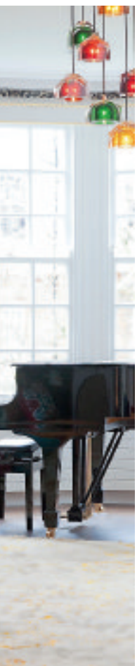
A TOUCH OF INDIAN AFFLUENCE NATURAL LIGHT POURS IN TO SHOW OFF FRETWORK AND FURNITURE WITH A DISTINCTIVE INDIAN FEEL (LEFT). THE PROPERTY ALSO FEATURED ARTWORK FROM SANKTI BURMAN (TOP RIGHT) AND A BESPOKE WINE ROOM TO SHOWCASE THE CLIENT'S IMPRESSIVE RANGE OF FINE WINE (RIGHT)